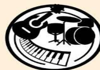
INTRO TO MUSIC

VISIT OUR WEBSITE FOR MORE INFO : WWW.IGNITEARTS.CO.NZ