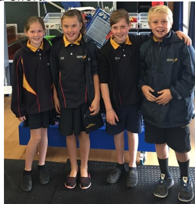
Above- Pekerau 1 Team

Congratulations to both of our teams who represented the school in the Waikato semi finals at Morrinsville Intermediate last week. They both performed exceptionally well, with the Pekerau 2 team coming in second place ensuring they qualified for the final which will be held this week at Fairfield Intermediate school. Good luck to those competing and congratulations to both teams for all your hard work and effort.